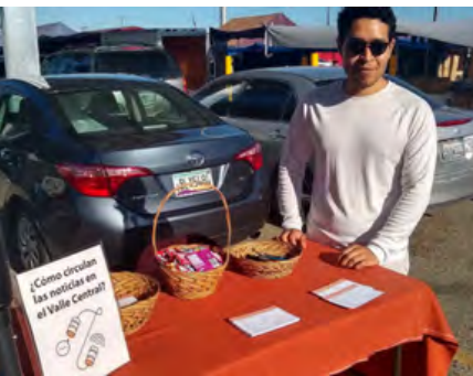
IEAS + INAS

We also provide power-building resources for our partners, meaning that we develop opportunities to share and support ideas, research, systems, and practices that build power and strengthen equitable media.