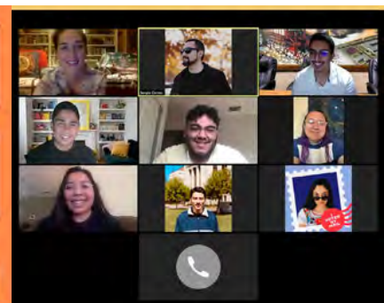
Help Desk + Partner Support

Tools to help partners understand geographic or topical information ecosystems