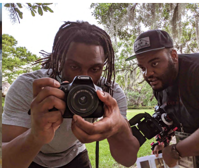
Seed Funding + Microgrants